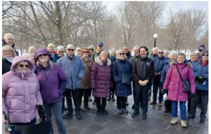
PROBUS ORV at Rideau Hall